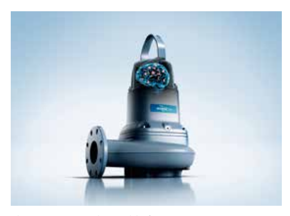
Flygt Concertor™the world's first wastewater pumping system with integrated intelligence