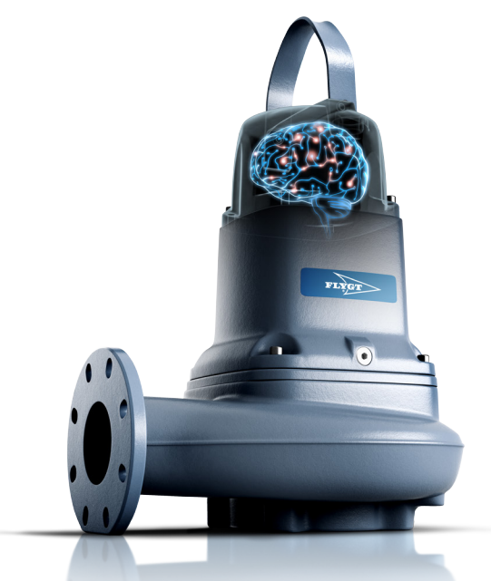
Fig 1: Intelligence integrated into a submersible wastewater pump

Intelligence refers to a pump system that can sense the environment it is working in as well as the load it