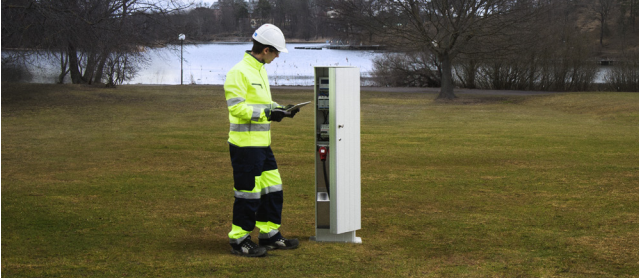
Fig 5: Size comparison between the traditional and new Flygt Concertor™ pump control cabinet