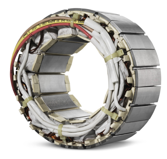
Fig 4: Concentrated synchronous motor (rotor and stator)