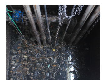
Fig 7: Wet pit surface before (Customer test installation)

When adding a gateway and a Human Machine Interface (HMI) pump and pump system data can be accessed and used. The HMI is required to display and adjust (if needed) system settings to suit user needs. HMI's ranging from basic monochrome displays to full-color touch screen units and smartphone/tablet applications are possible. This allows operators to view and control pumps and the entire pump system on location as well as remotely.