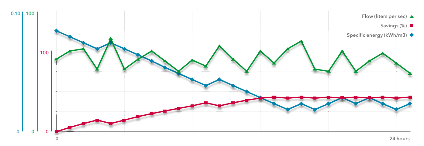
Fig 6: Patented Energy minimizer function continuously works to keep the pump system running at the lowest possible specific energy. Energy usage reductions of 25%-45% are commonly realized in wastewater applications. Each dot represents a complete pump cycle.

The intelligent wastewater pump is protected from incorrect impeller rotation at start-up because the motor's software makes sure the pump impeller always rotates in the right direction. This feature will save time for pump technicians at start-up and it will eliminate unneeded service calls to troubleshoot and correct this common start-up problem.